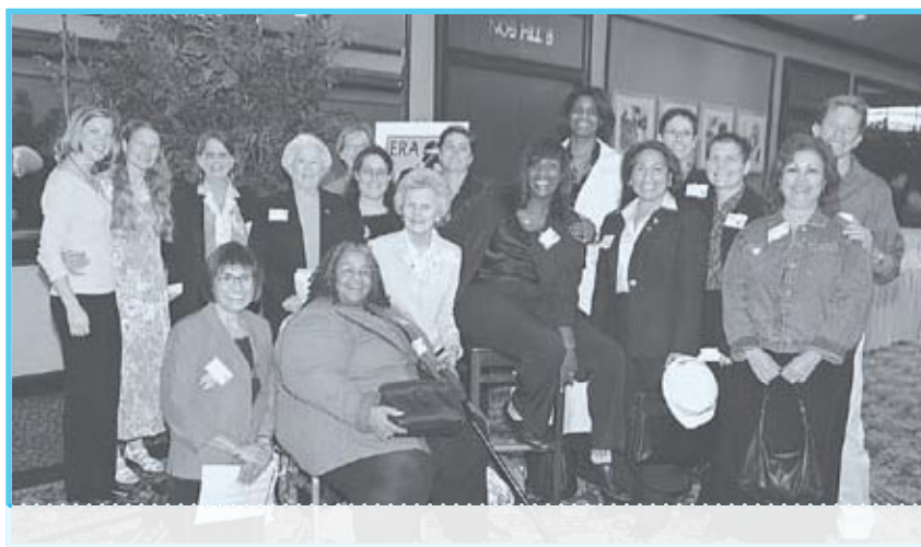
Members of ERA's legal team who work on our Tradeswomen Legal Advocacy Project and Tradeswomen, Inc., California's first organization for women in the trades. Tradeswomen, Inc. was honored at ERA's Luncheon in June for their leadership in building community among the growing numbers of women in blue collar and skilled craft jobs, and fighting for fair and safe conditions for women working in these nontraditional jobs.

In 2005, ERA continued to serve on an oversight committee of the San Francisco Federal Megasite Monitoring and Enforcement Project. The Project offers an important opportunity in the construction trades because the "megasite" designation carries with it a requirement to achieve and document pre-set affirmative action goals. ERA also worked with the California Apprenticeship Council Blue Ribbon Commission on an exit survey of all known journey level tradeswomen to identify barriers to retaining women in the trades. In addition to our long-standing collaborations with leaders of Tradeswomen Now and Tomorrow, and Tradeswomen, Inc., ERA joined Section 3 Advocates, a coalition using HUD's Section 3's requirements to place women in construction jobs. We began on-line dissemination of the "Tradeswomen Legal Advocacy Manual," as a resource for both the lay and legal communities. The Manual helps tradeswomen make a case for bringing a case when they seek counsel to represent them, and assists tradeswomen who are advocating on their own behalf.